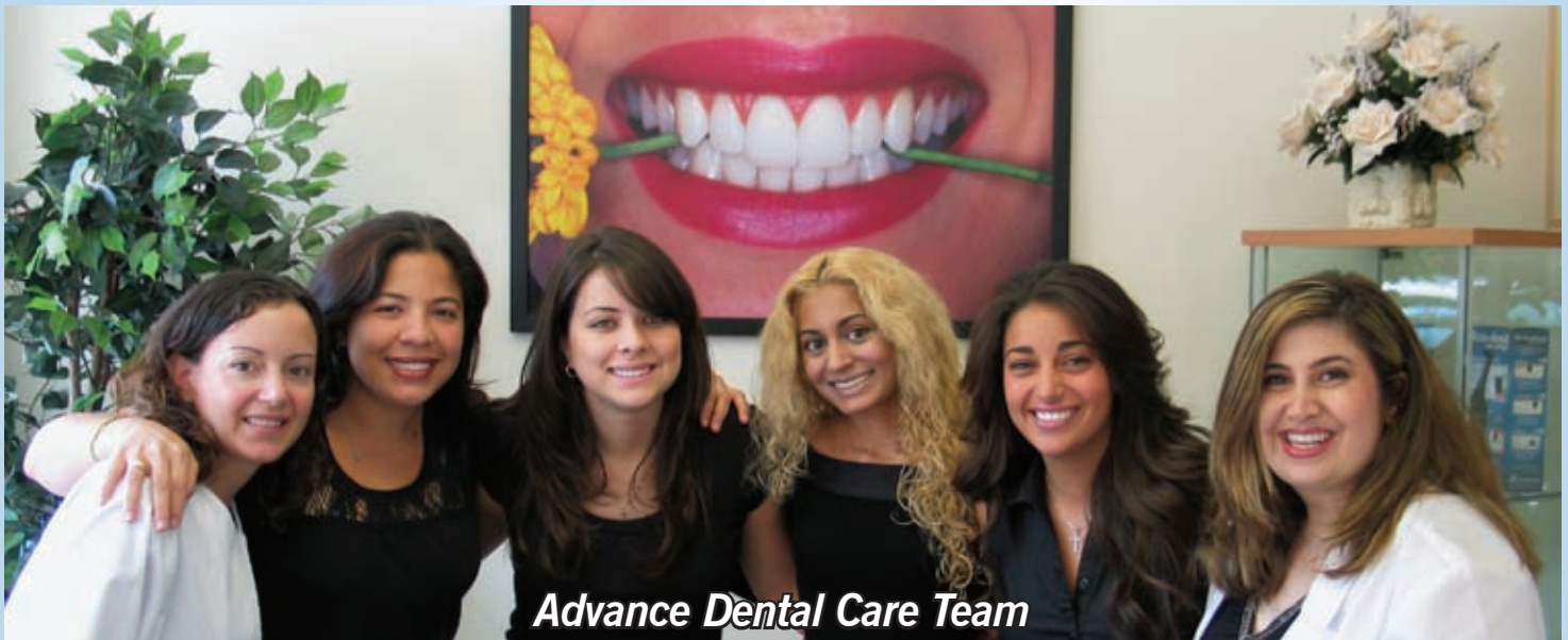
Advance Dental Care Team